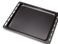
1 x Enamel tray