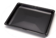
1 x Small Enamel tray