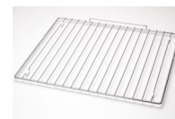
1 x Wire shelf with stopper